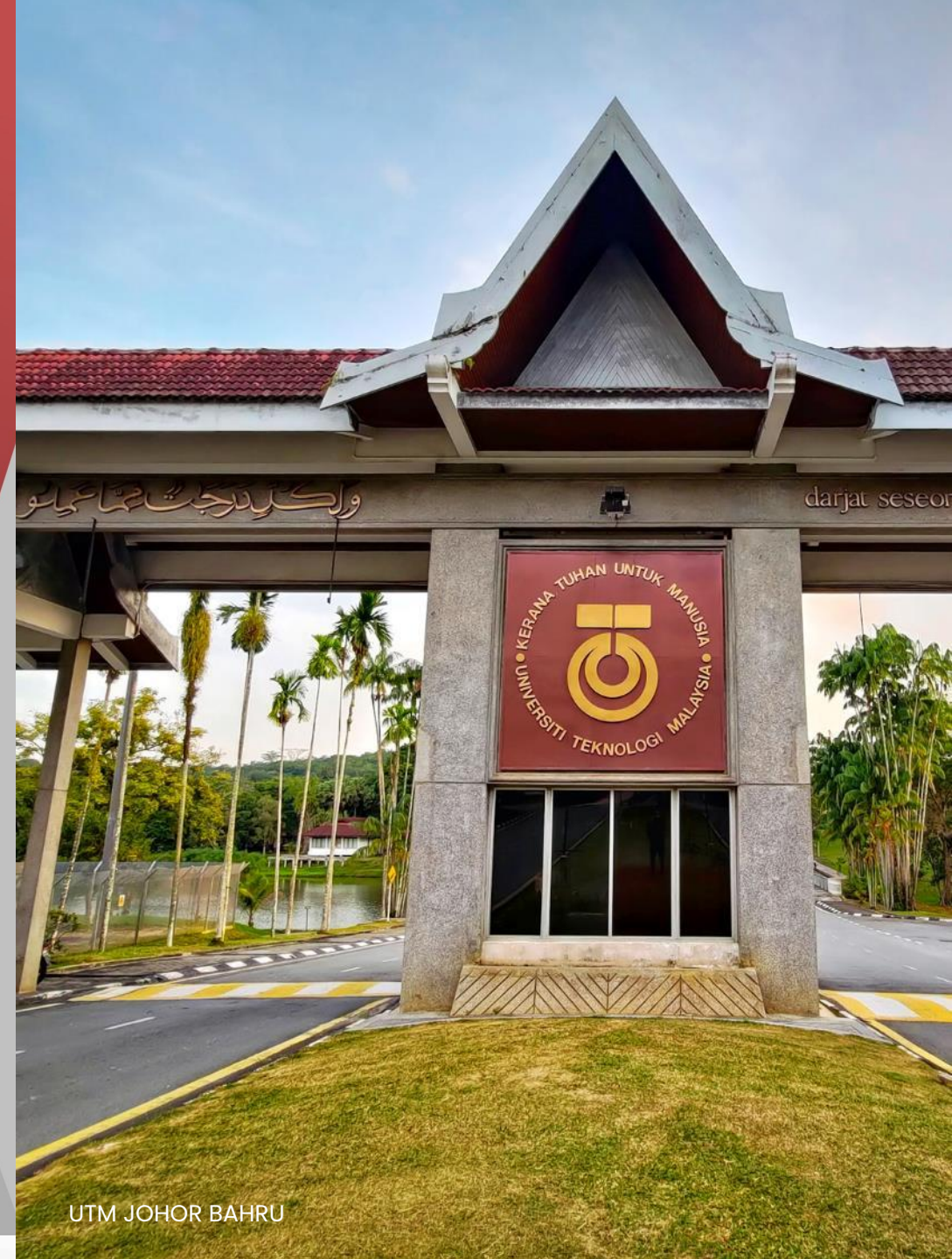
UTM JOHOR BAHRU